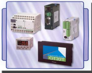
Panasonic ideas for life