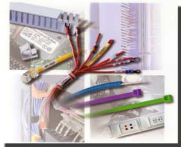
HellermannTyton Cable Management Products