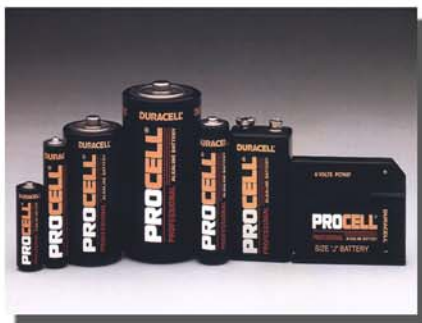
PROCELL PROFESSIONAL ALKALINE BATTERY